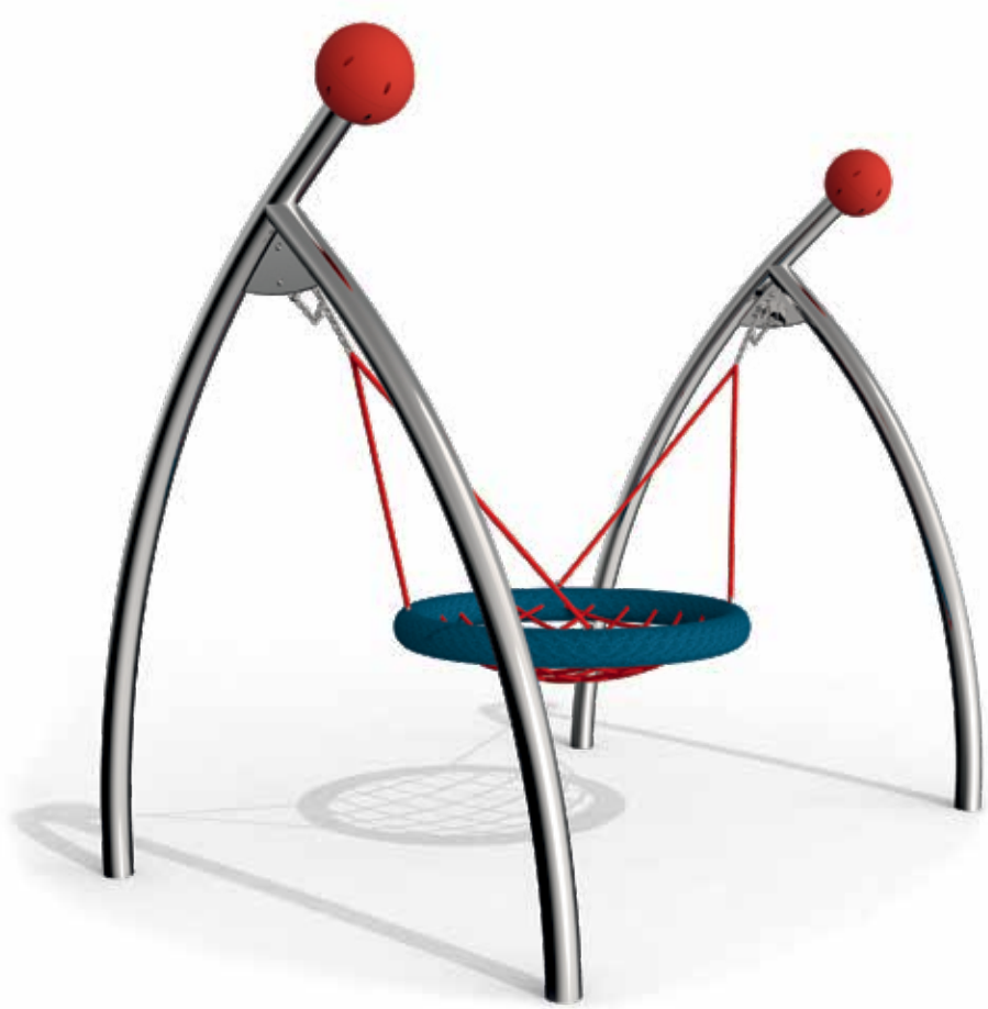
Diagram 1: Overall view of the play equipment