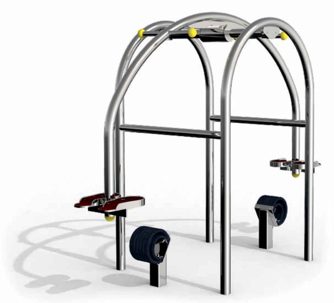
Diagram 1: Overall view of play equipment