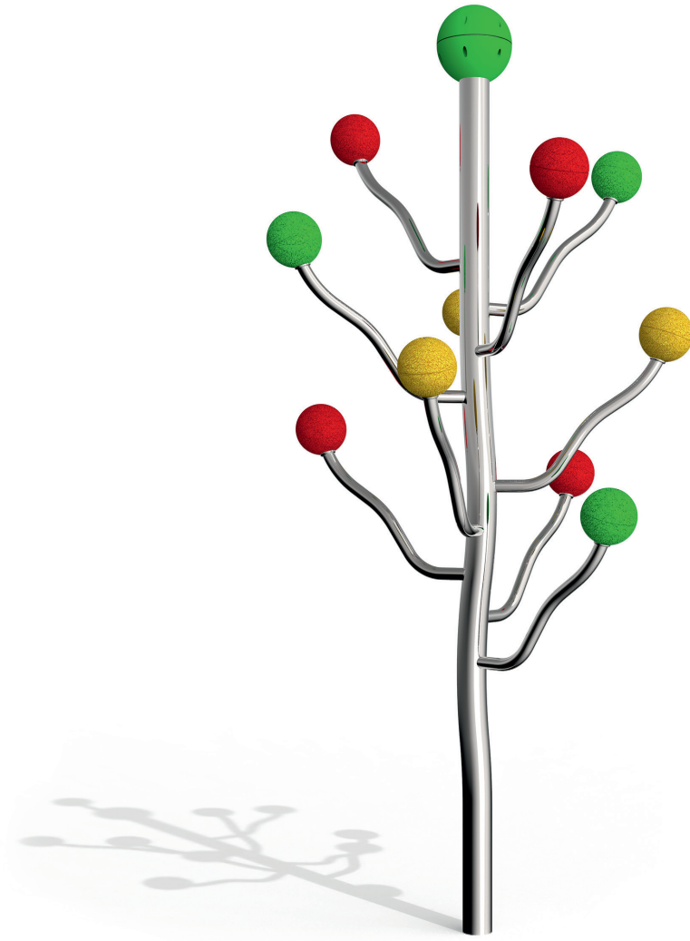
Diagram 1: Overall view of the play equipment