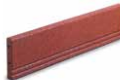
Path bordering 1000x50x250 mm with steel inlay, Item no. 2520001x4