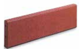
Path bordering 1000x80x300 mm with steel inlay, Item no. 2520301x4