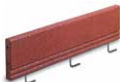
with Floor anchor Item no. 252000902

Path bordering provides flexible verges for playing fields and running tracks in the sports and leisure facilities sector. In addition, they are used in the design of driveways, parking lots or paths in the outside areas of houses.