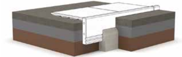
Path borderings without ground anchor.

Terrasoft® Path bordering (L x W x H) 1000 x 50 x 250 mm | SBR rubber granulate | Item no.: 252000xx1 Terrasoft® Path bordering (L x W x H) 1000 x 80 x 300 mm | SBR rubber granulate | Item no.: 252030xx1