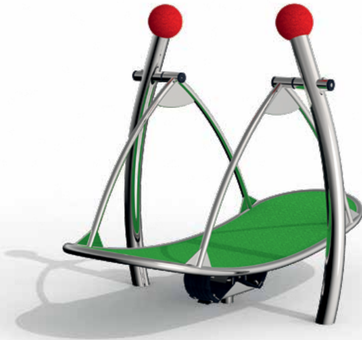
Diagram 1: Overall view of the play equipment