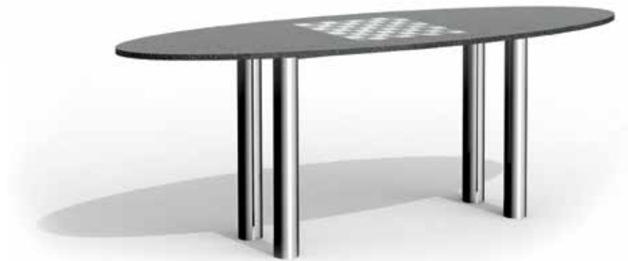
Item-No. 57 1521 401