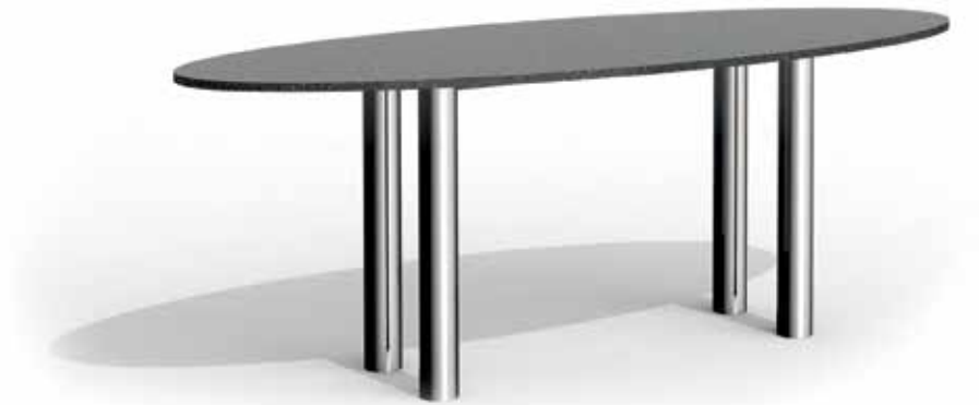
Item-No. 57 1520 401