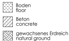
Diagram 2: Foundation plan