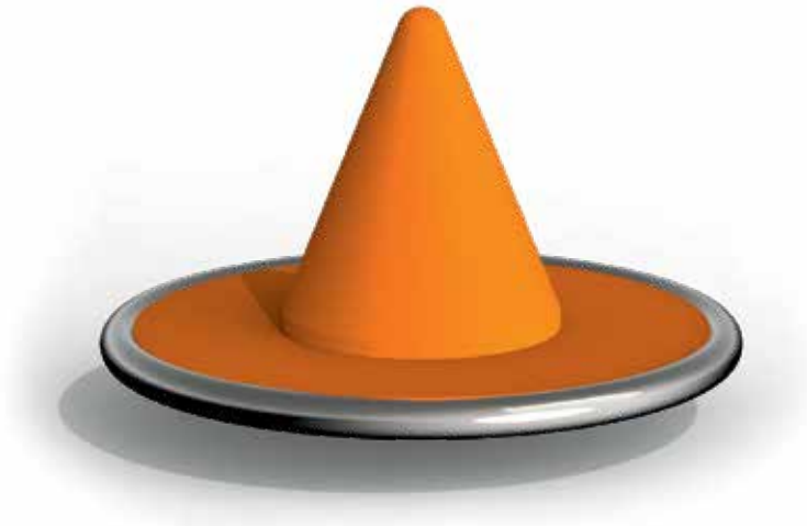
Diagramm 1: Overall view of the play equipment