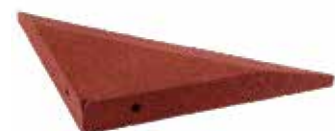
Large corner covering - Corner Item no. 255500xx2

The Terrasoft corner covering - large - is ideal for covering walls and wall projections as well as areas that involve the risk of injury from concrete elements in exterior areas.