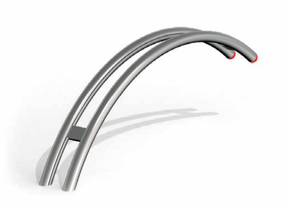
Diagram 1: Overall view