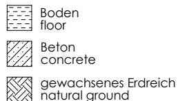
Diagram 2: Foundation plan