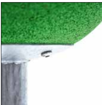
Fixation of Terrasoft floor anchor

Do not allow children to use the equipment during the setting period of 8 – 10 days (depending on weather conditions and foundation size).