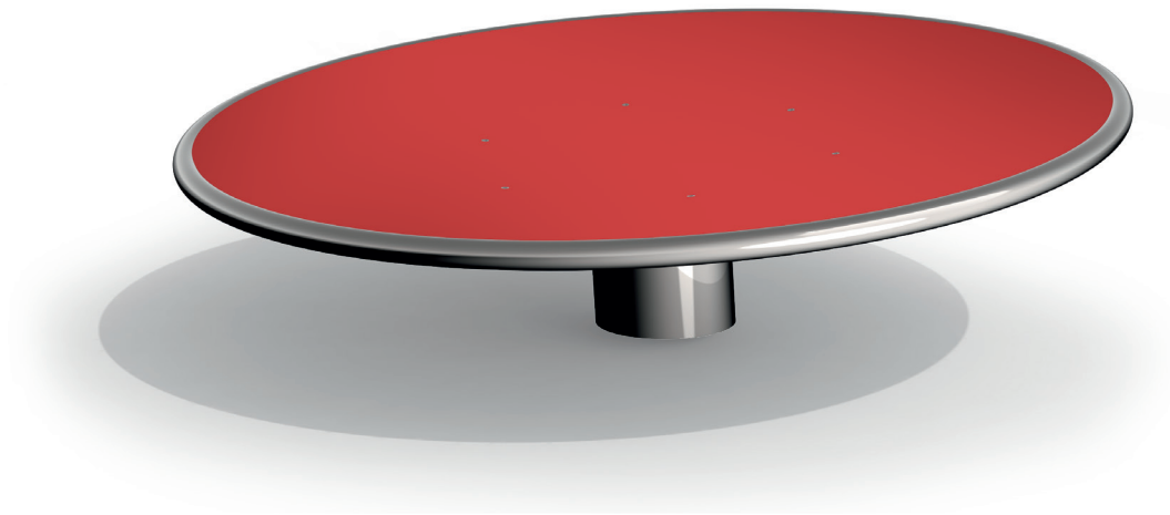
Diagram 1: Overall view of the play equipment