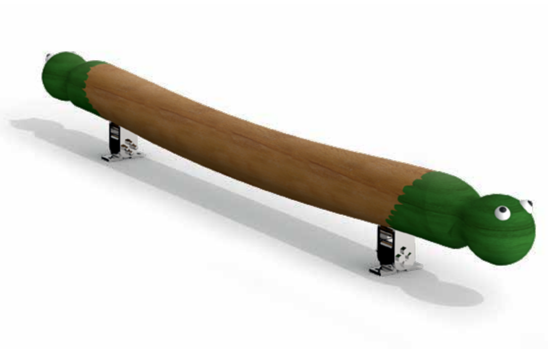
Diagram 1: Overall view of the play equipment