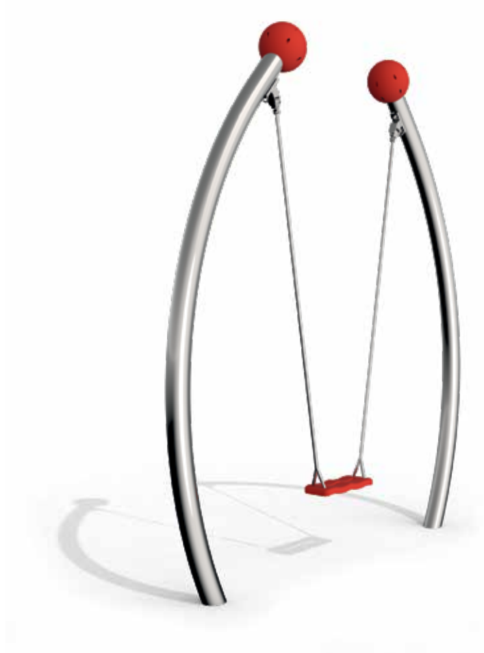
Diagram 1: Overall view of the play equipment