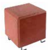
with Floor anchor Item no. 256500109

The Terrasoft cube finds a use in numerous areas: whether as a border element for driveways and paths or as a seat, for example, near sandboxes. It can also be used in riding halls or stable alleys. A particularly impressive game feature is the cube as a climbing pyramid. Different colours stimulate imaginative play of the children. For even more design variations, the cube is also available in EPDM colours.