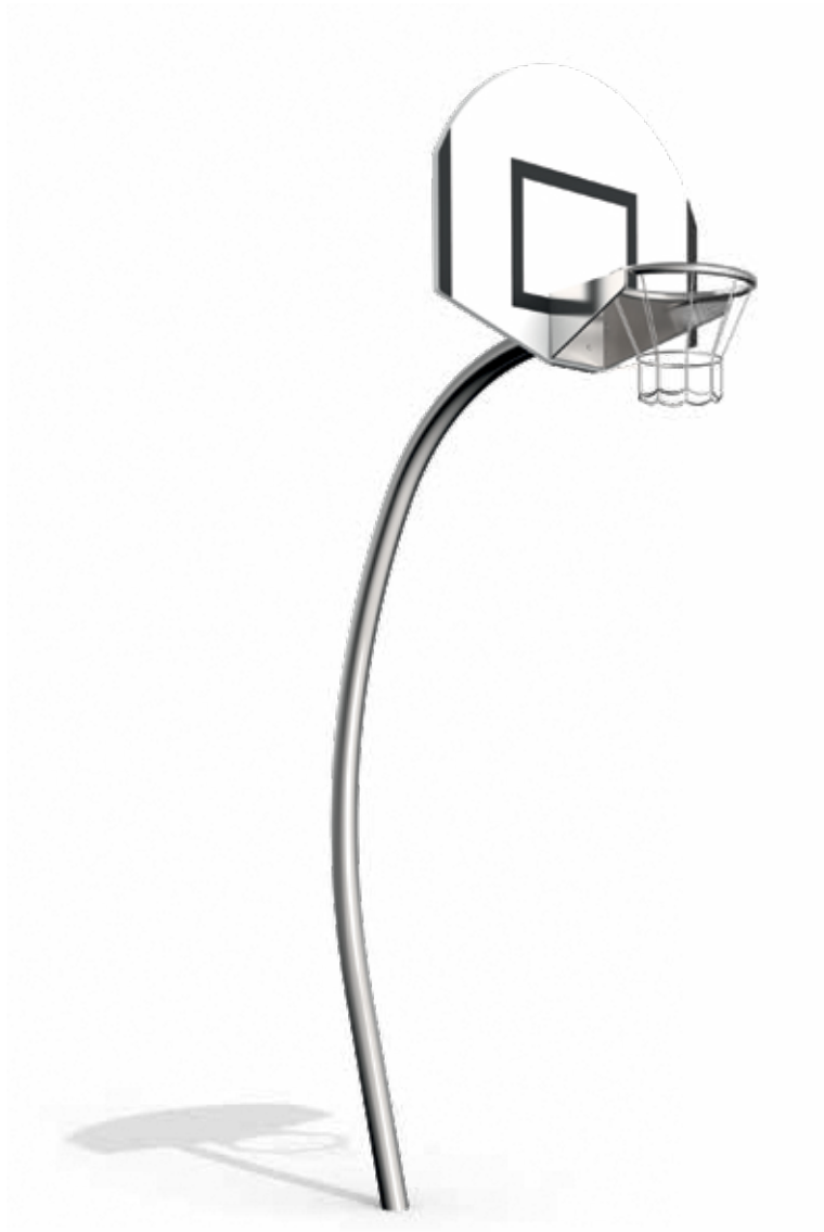
Diagram 1: Overall view of the sports equipment