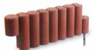
Floor anchor Item no. 254600992