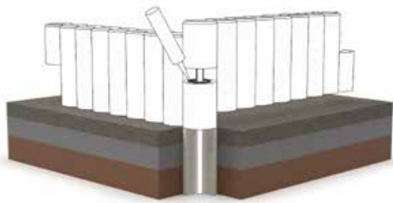
Positioning the chain element with the aid of extended mounting tubes on loose substrate. Glueing of the elements is necessary,