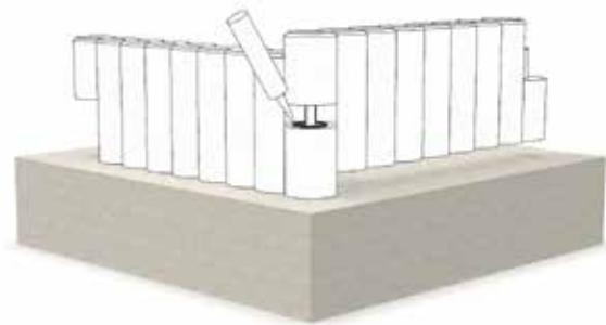
Positioning the chain element with the aid of mounting tubes on a firm substrate. Glueing of the elements is necessary,