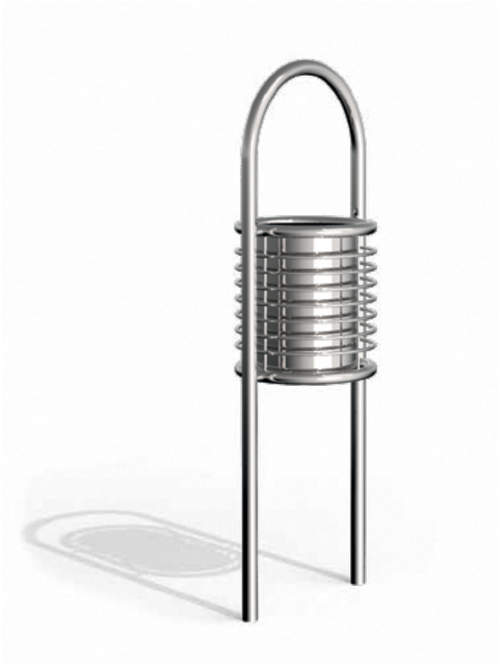
Item-No. 57 3020 401